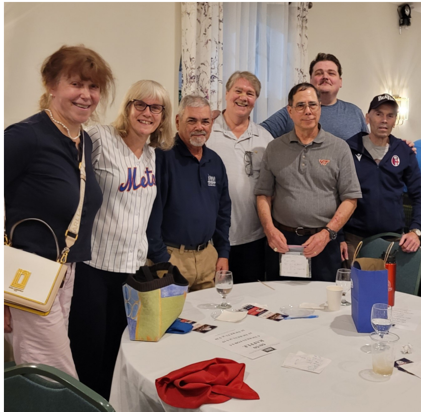
The scene at the Friends’ Trivia Night Fundraiser, held on Saturday, September 14, 2024 at the Elks Colonial Hall in Saratoga Springs